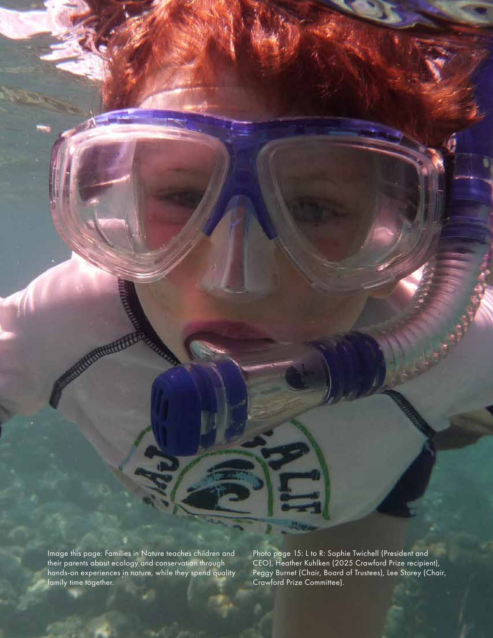
Image this page: Families in Nature teaches children and their parents about ecology and conservation through hands-on experiences in nature, while they spend quality family time together.