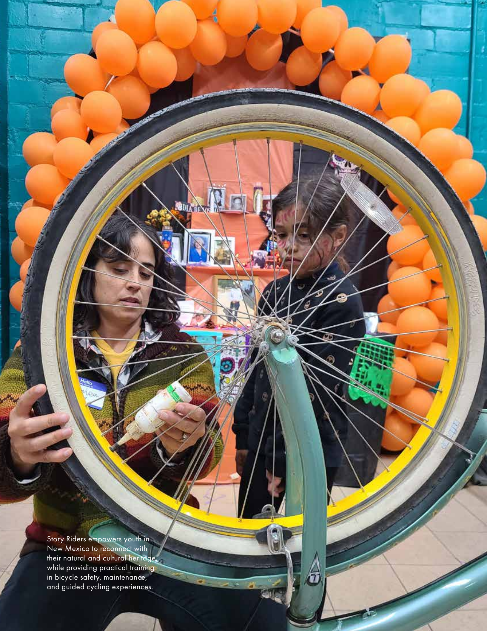
Story Riders empowers youth in New Mexico to reconnect with their natural and cultural heritage while providing practical training in bicycle safety, maintenance, and guided cycling experiences.

around organizations and communities that have historically struggled to attract philanthropic attention.