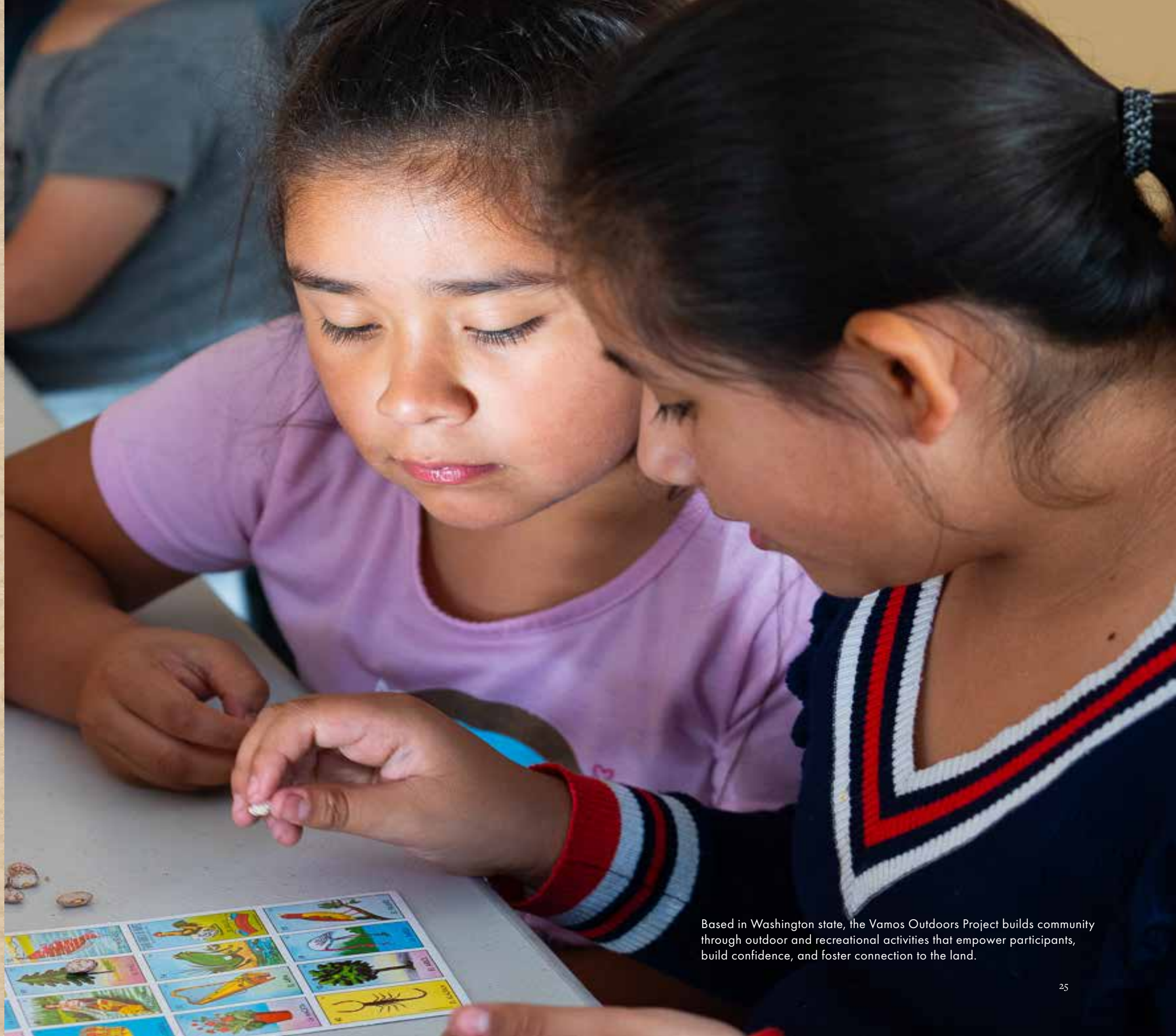
Based in Washington state, the Vamos Outdoors Project builds community through outdoor and recreational activities that empower participants, build confidence, and foster connection to the land.